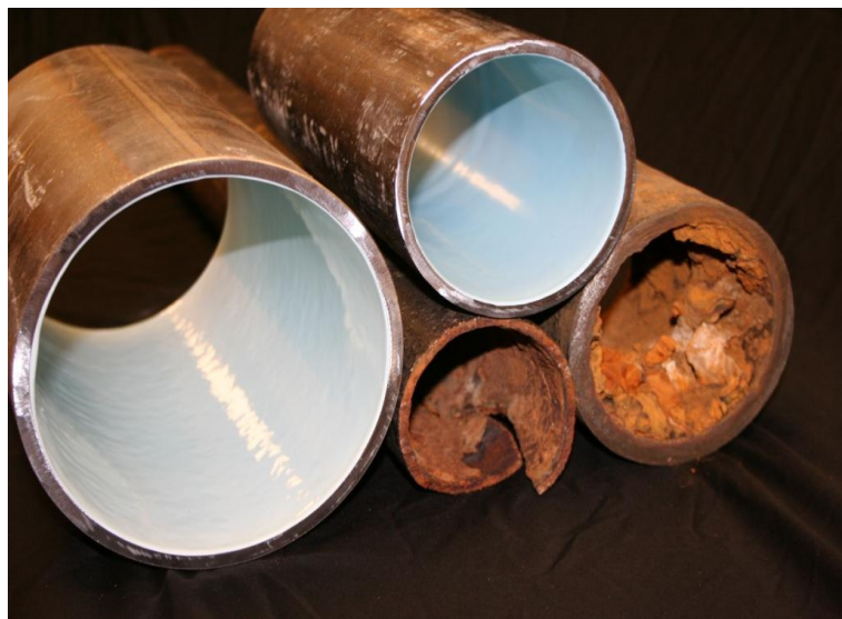
These are the new water pipes on the left that are being used to gradually replace the older crud laden water pipes on the right

The greatest danger we all face is this cocktail of chemicals that go on to form other often toxic compounds. One obvious example is the known carcinogenic Trihalomethanes that are created as a bi-product when chlorine is added to the water and then reacts with the organic material in the water. It should be noted that the water taken from lakes and rivers have a very high level of organic content because it meanders through many miles of forest.